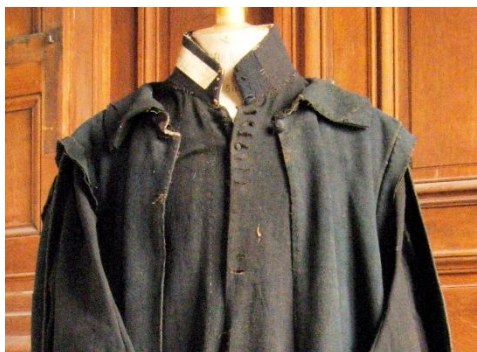
The Cassock of St. Vincent in Paris.

At first it seemed as if his influence were to be paramount in the Council. Nearly all the priests of Paris had passed through his hands at the ordination retreats and those who belonged to the "Tuesday Conferences" were intimately known to him. Who could be better fitted to select those who were suitable for preferment? Mazarin, it is true, objected to the Council on principle, but that was simply because he considered that bishoprics and abbeys were useful things to keep in reserve as bribes for his wavering adherents. Certain reforms on which Vincent insisted were not to his mind either, although he offered no opposition. It was not his way to act openly, and he bided his time; the wonder was that Vincent was able to do what he did so thoroughly.